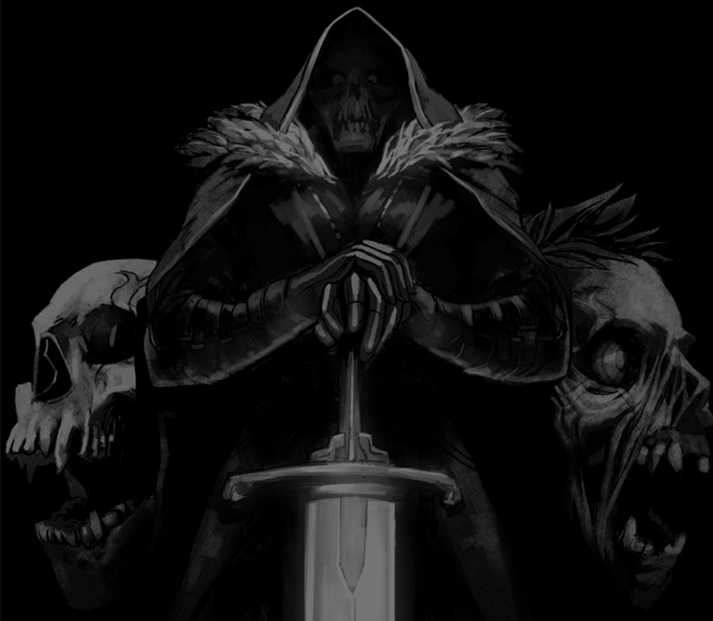
Illustration Support Daisuke Tooya